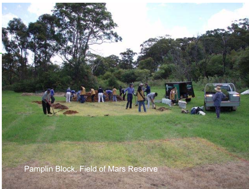
Pamplin Block, Field of Mars Reserve

As a result of running the RNC Workshops it was identified that we are losing our local small native birds