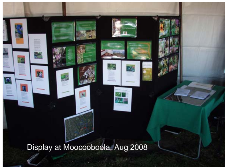
Display at Moocooboola, Aug 2008

Taronga Park Zoo was going to be involved in sustainably using the bamboo which borders some of the grass area at the Pamplin Block. Unfortunately their collection vehicle is not appropriate to the terrain.