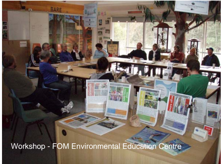
Workshop - FOM Environmental Education Centre

We have run a display at Moocooboola in Hunters Hill (and have others planned for August 2 nd at Boria Park and Aug 5 th at the Ryde Business and Sustainability Expo).