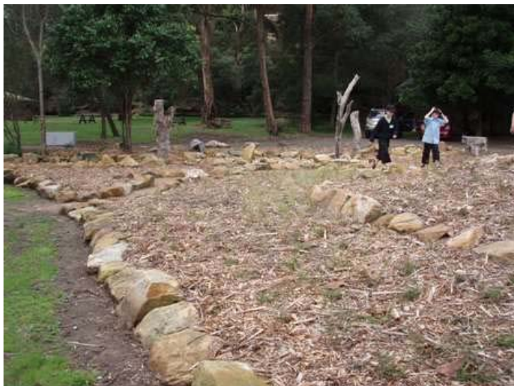
Field of Mars Environmental Education Centre's habitat planting demonstration site - newly planted

A donation from Johnson Controls Australia in Macquarie Park for $1,000 USD ($1136 AUD) has been earmarked for urgently need invasive vine control at Greenwood Park, in partnership with City of Ryde. Vines being targeted are Morning Glory and Blackberry. The National Trust will be employed via Council to undertake this work. It is anticipated that the works will be undertaken in October / November 2010. Johnson Controls have already also donated their time to start this vine removal. Thank you Johnson Controls Australia for the interest, energy and donation.