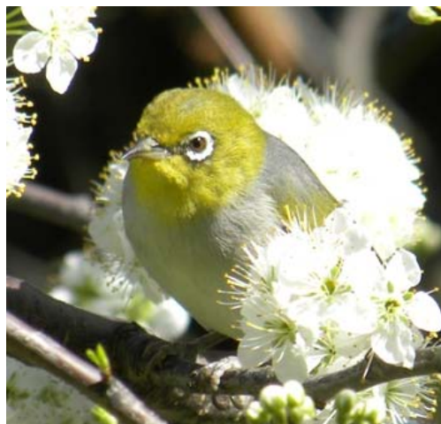
Silver-eye one of our indicator species