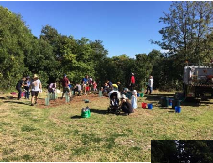
Left: Bedlam Bay planting of a small bird habitat haven Lower Parramatta River Project - July 2017.