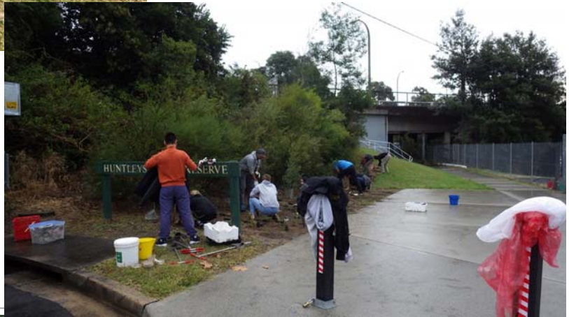
Right: This Tarban Bridge habitat planting has been used as nesting site by Superb fairywrens since 2014. Extension planting was undertaken in 2016 and during this past year. This photo 2016. Hunters Hill Small Bird Corridor.