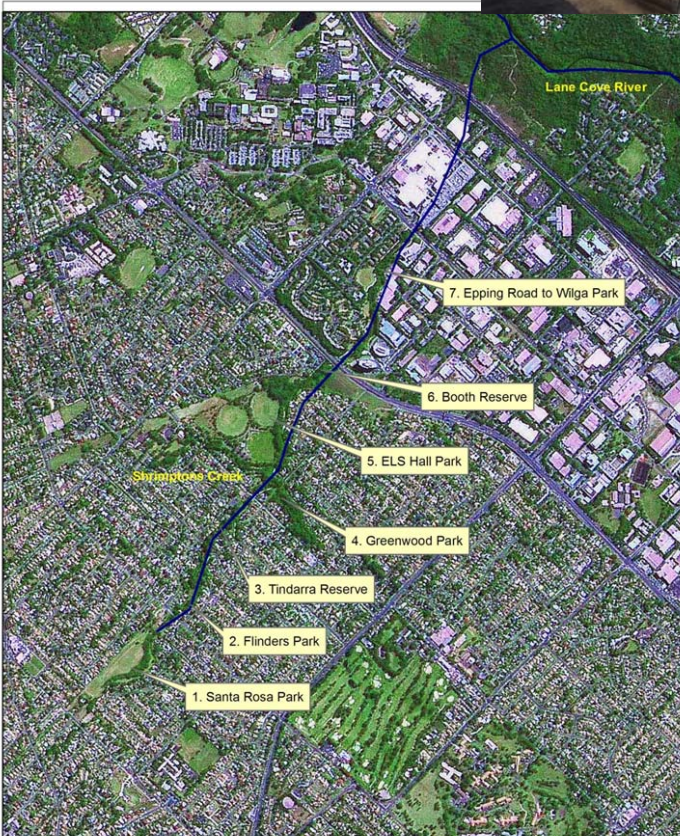
Map showing Shrimptons Creek Small Bird Habitat Corridor