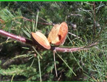
Bushy needlebush ( Hakea sericea ) shrub