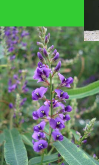
Hardenbergia ( Hardenbergia violacea ) vine

Red-browed finch and other small birds need native plant habitat islands in people's gardens to help them survive.