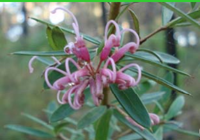
Pink spider flower ( Grevillea sericea ) shrub